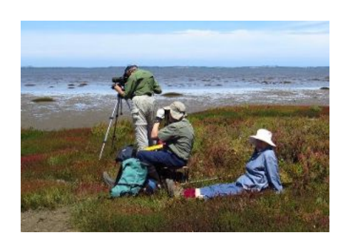
Ren and Julianne with a friend counting birds on Western Port.

Ren Millsom: "I have been measuring changes of certain sand beaches in Western Port Bay."