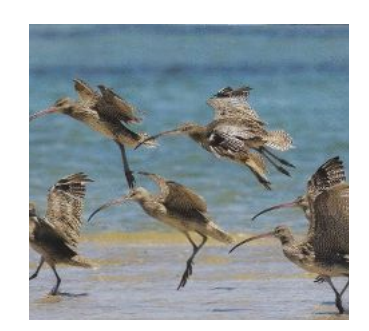
Eastern Curlew which breed in NE China

metres wide strip of coast in 20 years. Now Google didn't exist in 1974 but I can But the sand is then swept along the