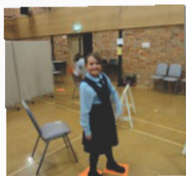
GLEN WAVERLEY UNITING CHURCH