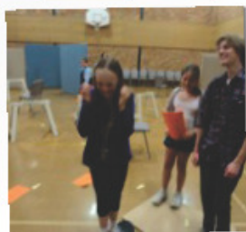
UTHIES IS OPEN TO GRADE 4, 5 & 6 AT PRIMARY SCHOOL