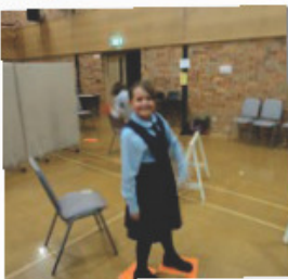
GLEN WAVERLEY UNITING CHURCH