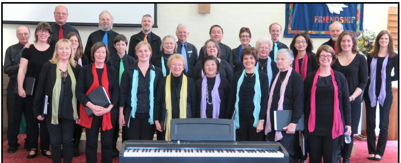
Free Spirit at Boronia UC on August 24 2014, L to R: