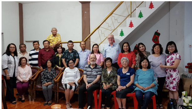
Worship and supper with one of the kolums (cell groups) of the Riedel congregation.