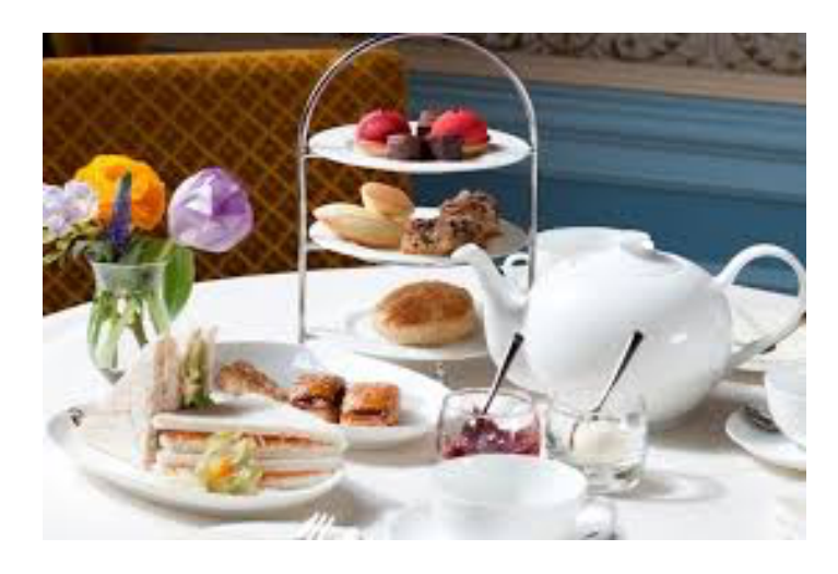
Entertainment and High Tea in Fellowship Area

Glen Waverley Uniting Church on Sunday 14 October 2018 2pm to 4pm