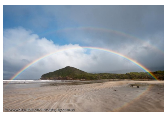
Cox Bight where in the Palawa dreamtime, life on earth began:

Tasmanian Wilderness World Heritage Area.