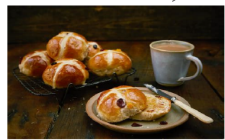
and help support THE ROYAL CHILDREN'S HOSPITAL

Join us for hot cross buns, tea or coffee