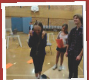
UTHIES IS OPEN TO GRADE 4, 5 & 6 AT PRIMARY SCHOOL