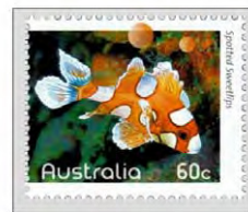
Trimmed too closely